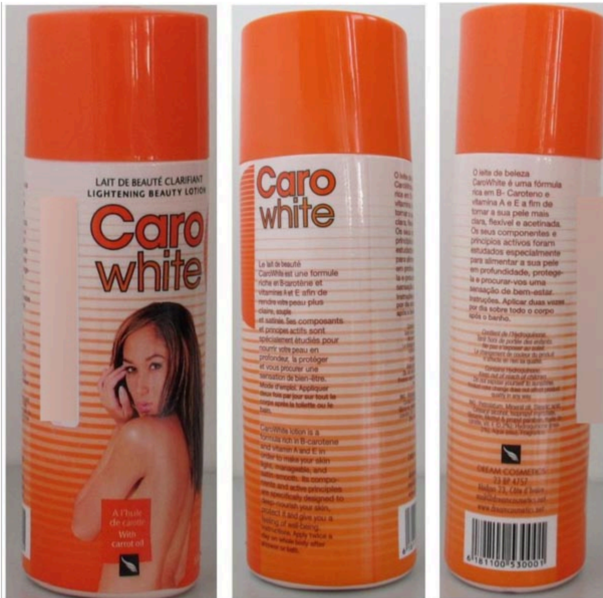
1 of 1 photo