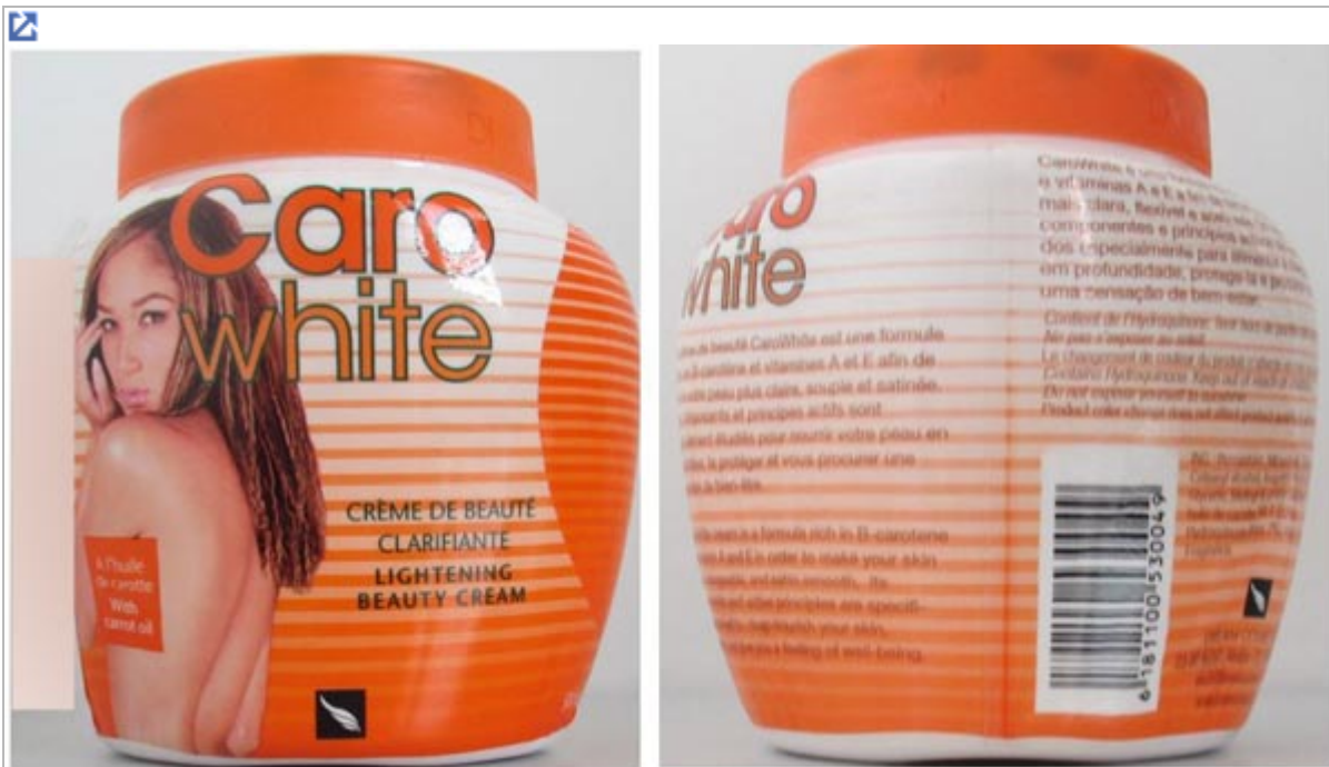
1 of 1 photo